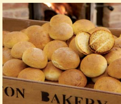
Manchet (Breakfast Roll)