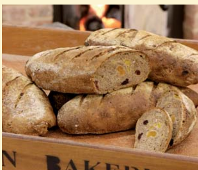
Honey & Nut