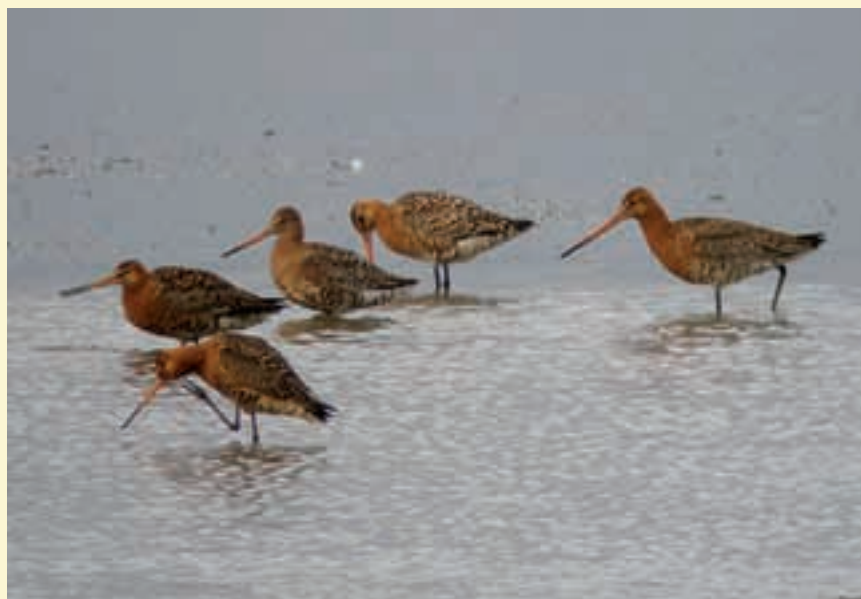
Black tailed Godwit

As for the lagoons, they really need to grow their reed beds and plant life before they will appeal to me but the ducks and waders love them. The main part of Rutland