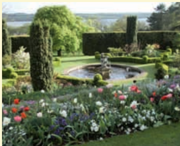
Garden April 2010

Throughout the year we have several Special Breaks and Late Breaks, for further details please see our website, www.hambletonhall.com under Accommodation.