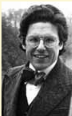
Recent photo of the author (Are you sure? Ed.)

Telephone: (01572) 756991 Fax: (01572) 724721 www.hambletonhall.com E-mail hotel@hambletonhall.com Hambleton Hall, Hambleton, Oakham, Rutland LE15 8TH