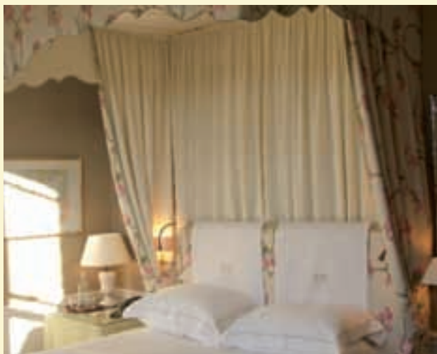
Chintz has become Cherry in 2010