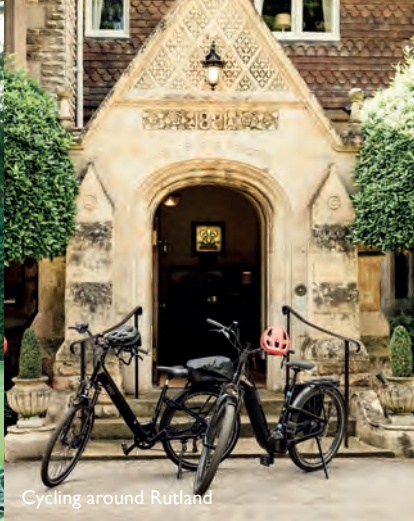
Cycling around Rutland